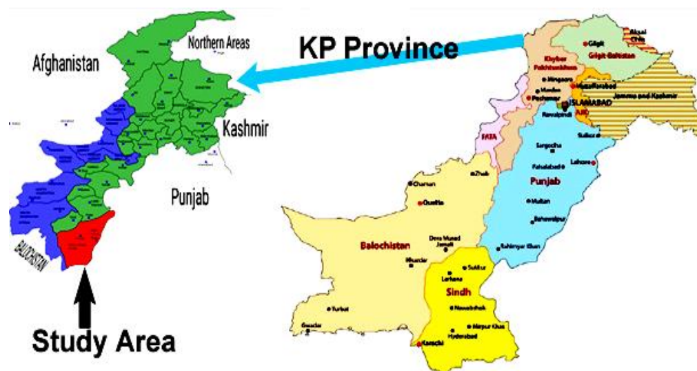
Fig. 1: Map of Pakistan (right side) showing all provinces and on the left side is Khyber Pakhtunkhwa Province and Dera Ismail Khan (study area in red color).

Samples were collected from 20 different villages of D.I. Khan (Fig. 1) including Garrah Rehman, Kulachi, Hathala, Draban Kalan, Chudhwan, Musazzai, Hassani, GarrahJat, Garrah Ali, Garah Meharban, Lar, Kala Ghore, Kot jaiee, Abdul Khel, Shah Hassan Khel, Panyalla, Wanda Madad, Wanda Kali, Yarak and Rori Khel, where dromedary camels are raised. The area covers pane land and somewhere sandy area.